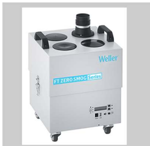
Fume extraction devices